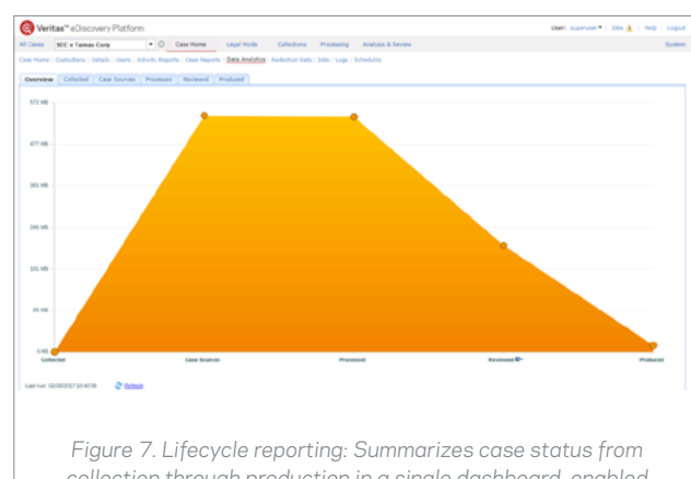
Figure 7. Lifecycle reporting: Summarizes case status from collection through production in a single dashboard, enabled unparalleled visibility into every stage of eDiscovery

eDiscovery dashboard—Provides detailed analytics of all eDiscovery cases across an organization in an automatically generated graphical report.