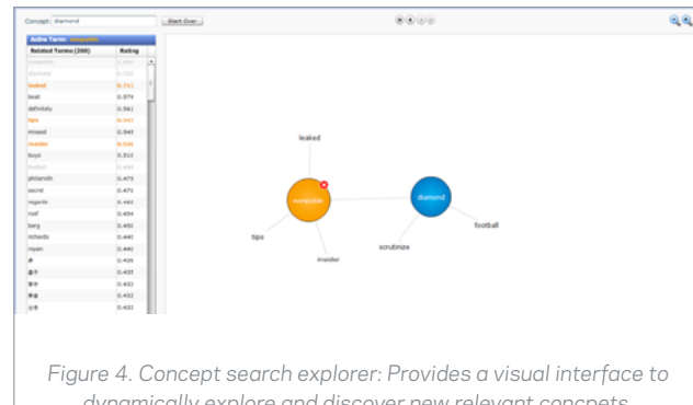
dynamically explore and discover new relevant concpets.

Multi-keyword search—Runs up to 100 searches simultaneously and provides reporting to test effectiveness of searches.